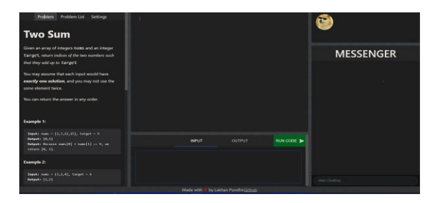
Fig3. Problem page which shows the problem statement. It also shows the input format, output format and some text cases. User can write the code in the real time code editor. User can perform remote code execution in 5 different languages (C++, Java, Python, Javascript and GO). User provides input from the input box and then click the run code button and then can check the output in output box below.